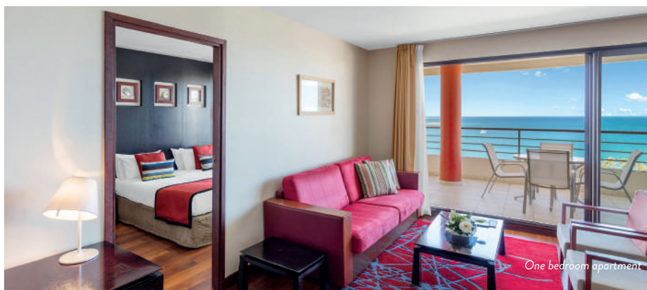
One bedroom apartment

All our 1 & 2 bedroom apartments are equipped with: