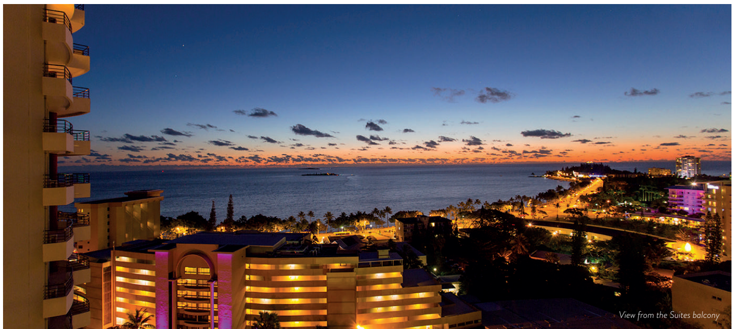
View from the Suites balcony

Welcome to Ramada Hotel & Suites, Noumea. The perfect getaway destination for your next fabulous wine and cheese weekend or perhaps take the family for a wonderful holiday in the heart of Anse Vata Bay!