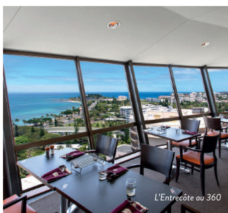
L'Entrecôte au 360