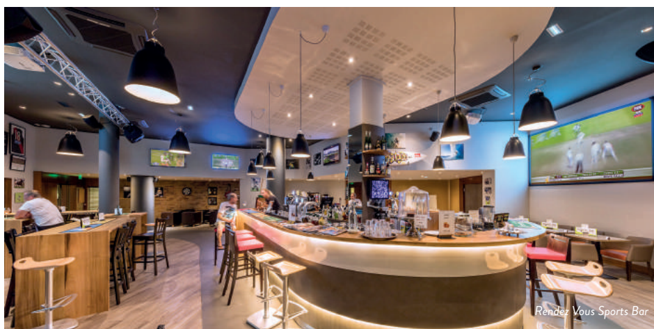
Rendez Vous Sports Bar

“Le Rendez-Vous” Sports bar is a fun place to meet and unwind over your favourite drink or sample one of our exotic cocktails. Large flat screen TVs broadcast all major sporting events from around the world.