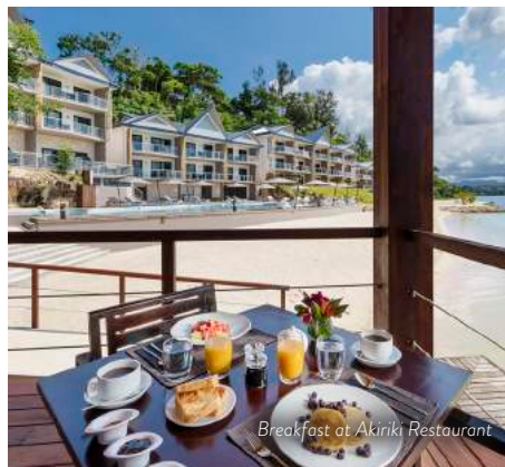
Breakfast at Akiriki Restaurant

Opening hours: Breakfast 7am-10am Lunch 11am-3pm Dinner 6pm-10pm